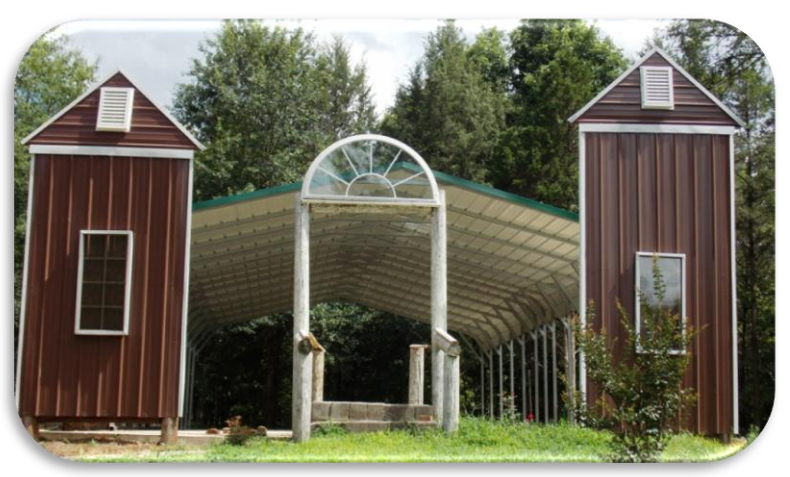
July 22, 2015