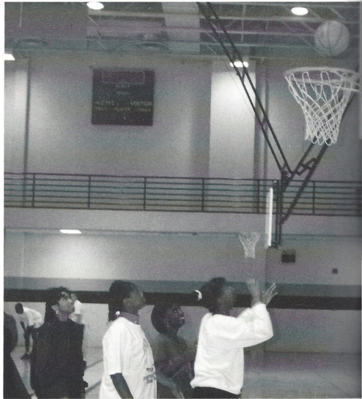
Girls in P.E. are using their basketball skills to shoot around and have a little fun.