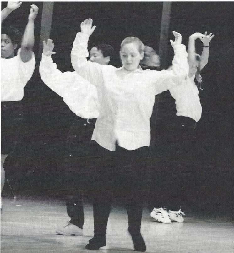
"And 1 and 2 and 3 and . . ." Members of the Dance Troop show off their talents in a dance routine.