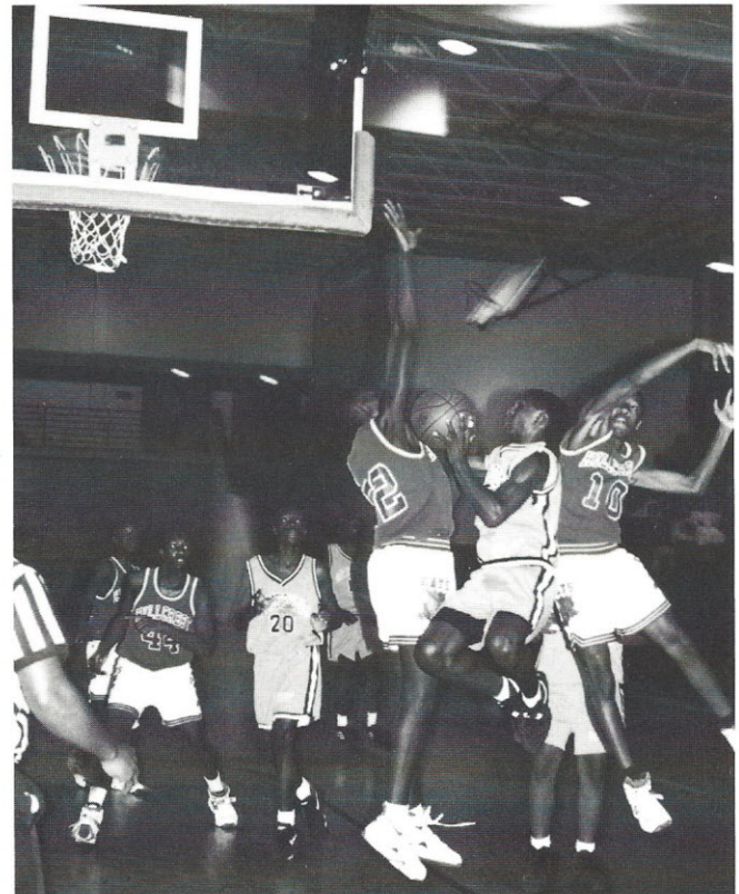
The visiting player passes the ball to an open teammate as the Griffin player tries to get the ball.