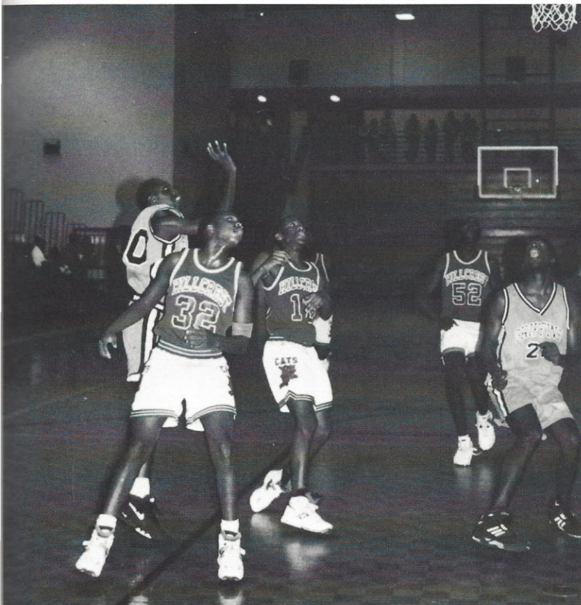
Waiting to see if the ball will enter the hoop, the other team's members get ready for the rebound.