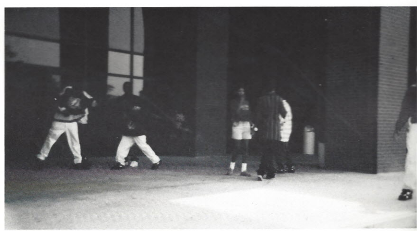
Goofing Off During Lunch! Some students clown around after lunch in the ampitheater to burn calories.