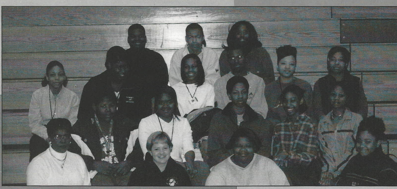
Above: The members of the Second Block D.E.C.A. Club gather for a picture.