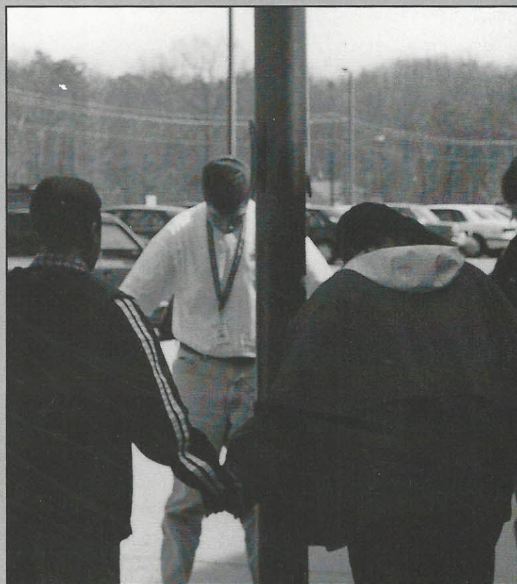
Above: Students and faculty gather each Thursday morning before school starts for a morning devotional.