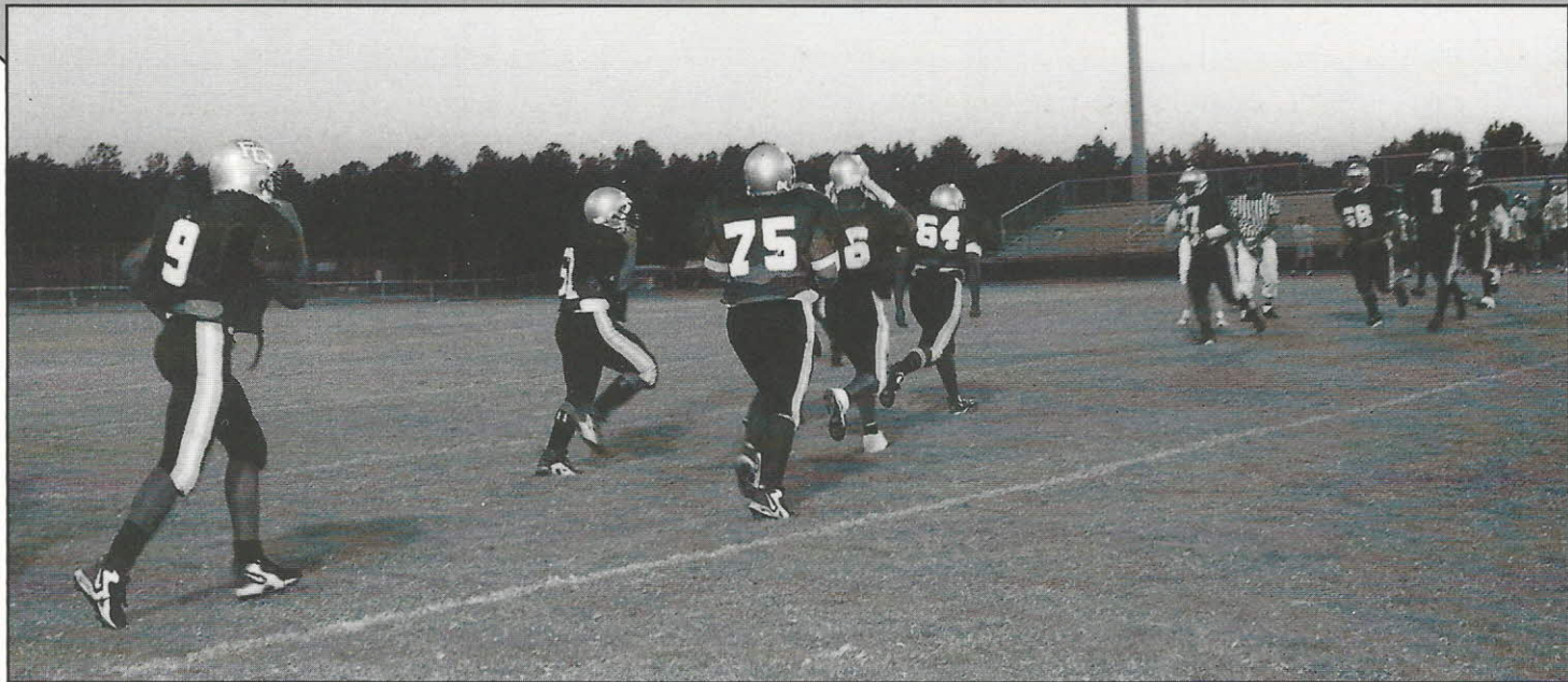
Above: The Griffin offense runs onto the field after an excellent stand by the defensive unit.