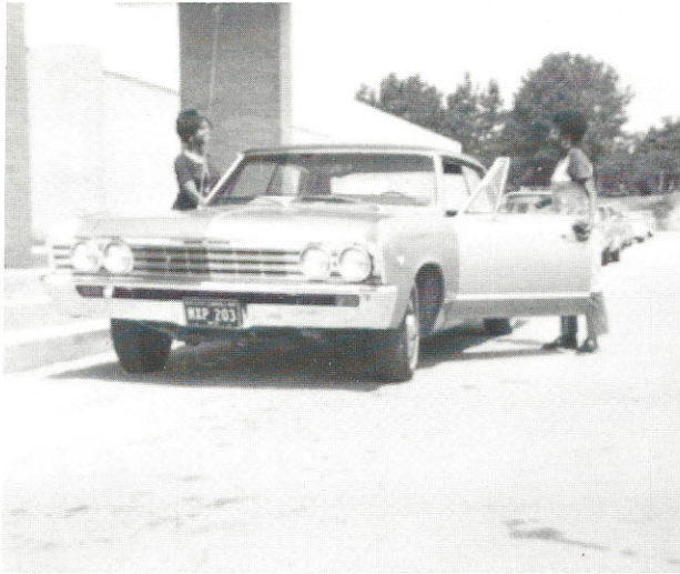
Should we go in or leave?