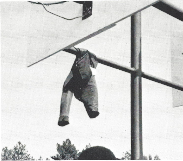
This wouldn't have happened if you'd use a ball.