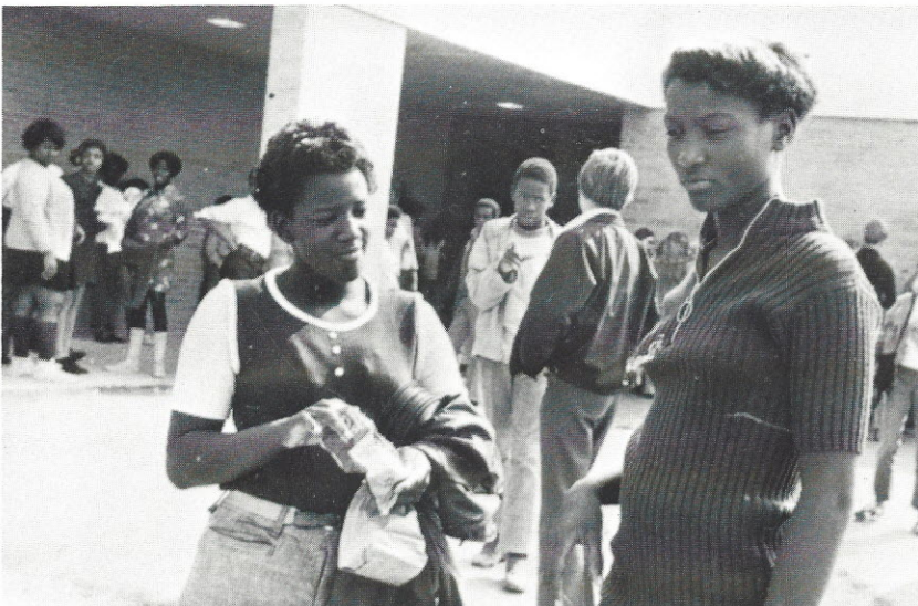
I think that you could at least give me one.