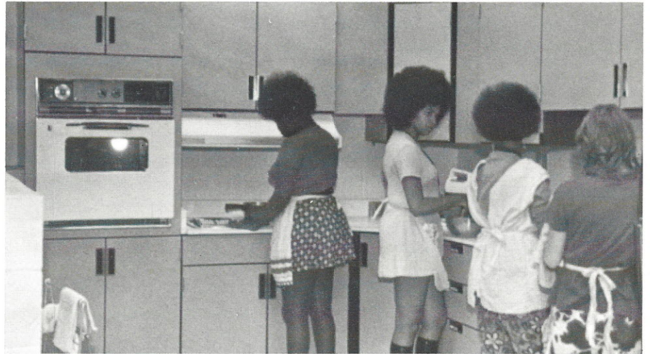
I'd rather do it myself.