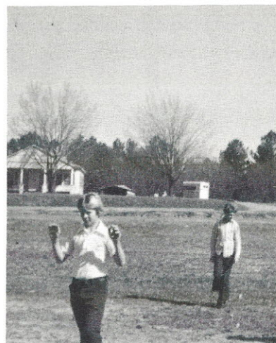
Checking the control cables