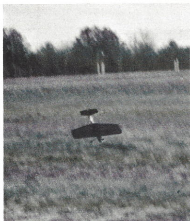
Before and after the crash