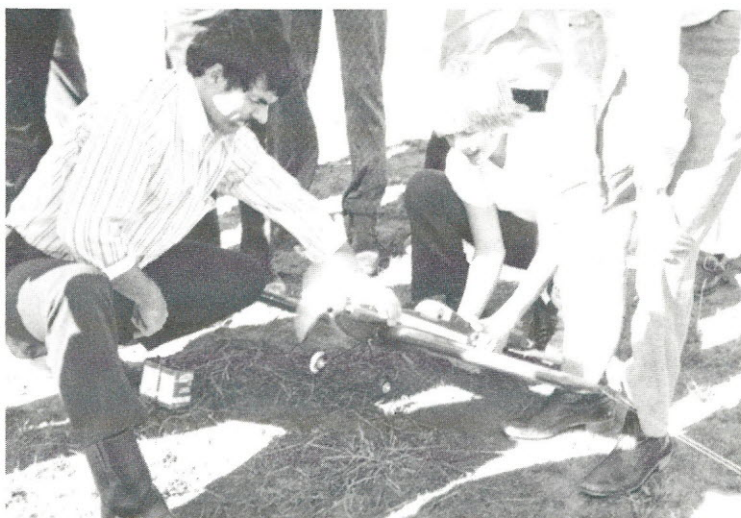
Adjusting engine speed