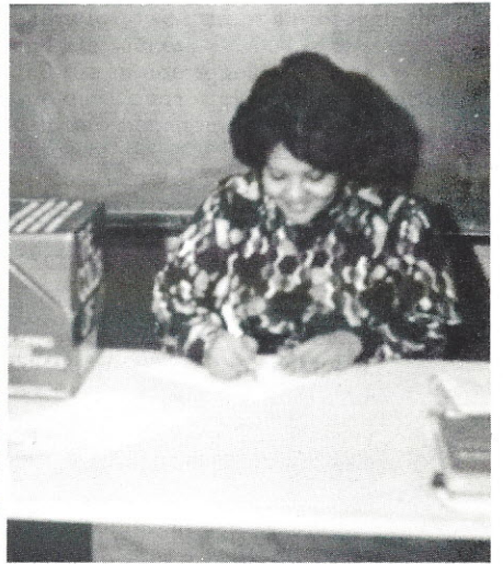
Students, teachers and teachers' aids spend time in preparation before entering the classroom.

The following pages are included to show some of the classroom activities.