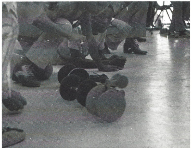
What Science student could forget the "Lamouse 500?" Students built cars out of mouse traps and competed in a race.