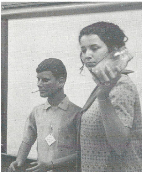
A representative of the Columbia Tuberculosis Society brought a "smoking dummy" to demonstrate the dangers of smoking.