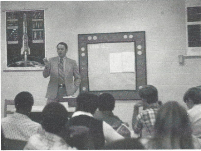
The medical profession assisted in a unit on health.