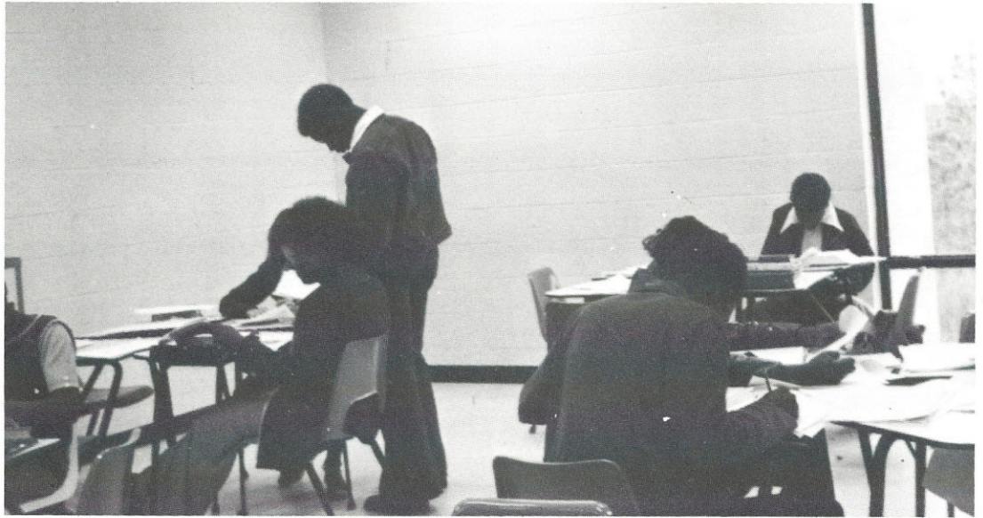
Ninth graders get totally involved in their work.