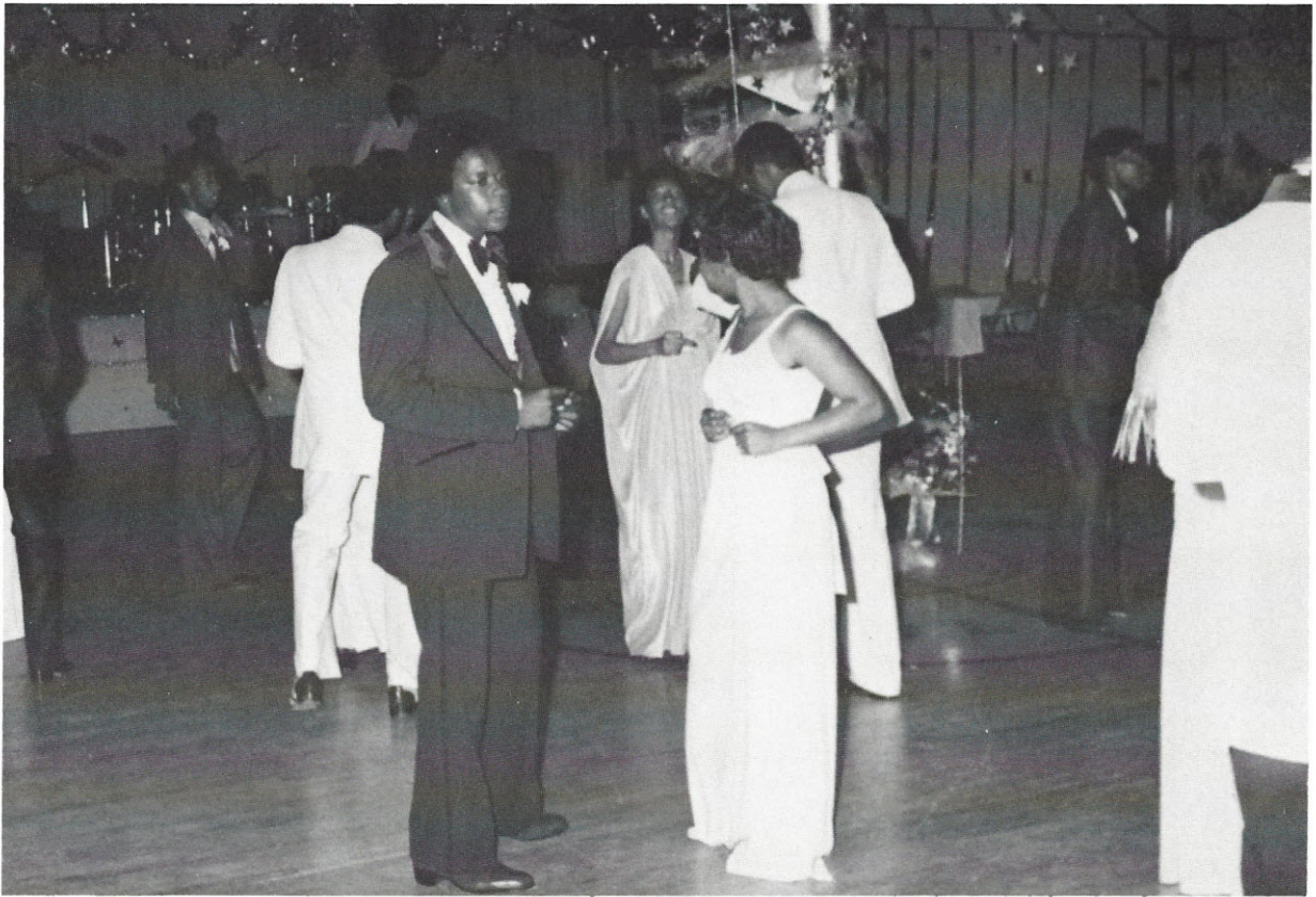
AT THE PROM. "WISHING UPON A STAR"