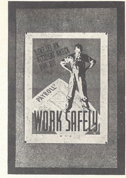
The above illustration shows the 24" x 36" size DAV-SON Cork Back Bulletin Board, plain, without glass door. See price list.

FACTORIES SCHOOLS OFFICES STORES CHURCHES CLUBS PUBLIC BUILDINGS HOSPITALS SALES ROOMS