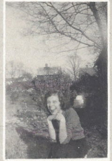
What does she see?