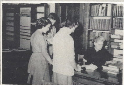
This one or that one?