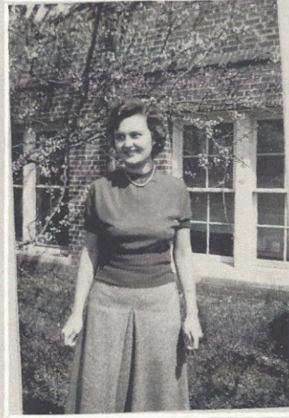
In the spring...