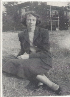
M A C