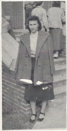
The pause that helps refresh