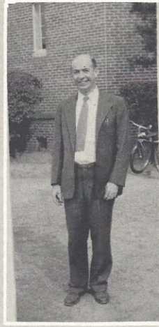
A smiling professor