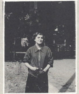
Is he late?