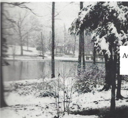
ACTIVITIES Page 65