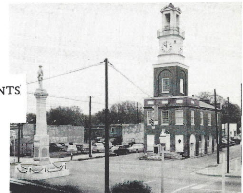
ADVERTISEMENTS Page 105