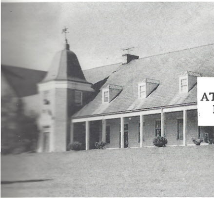
ATHLETICS Page 41