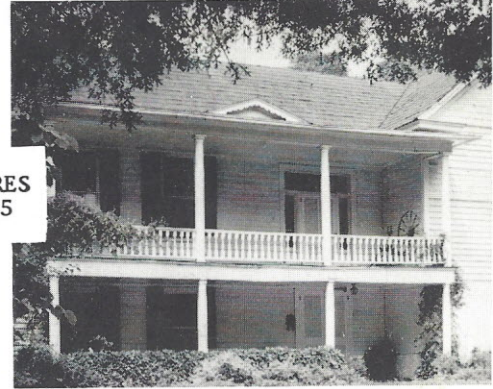
FEATURES Page 85