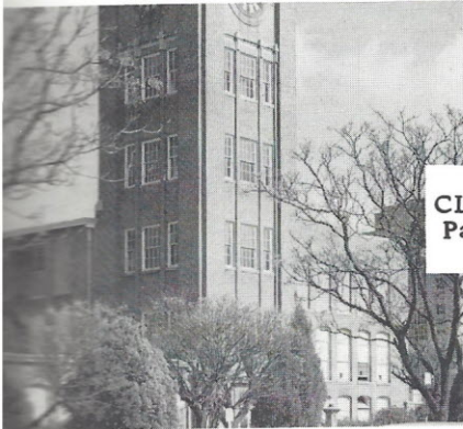
CLASSES Page 11