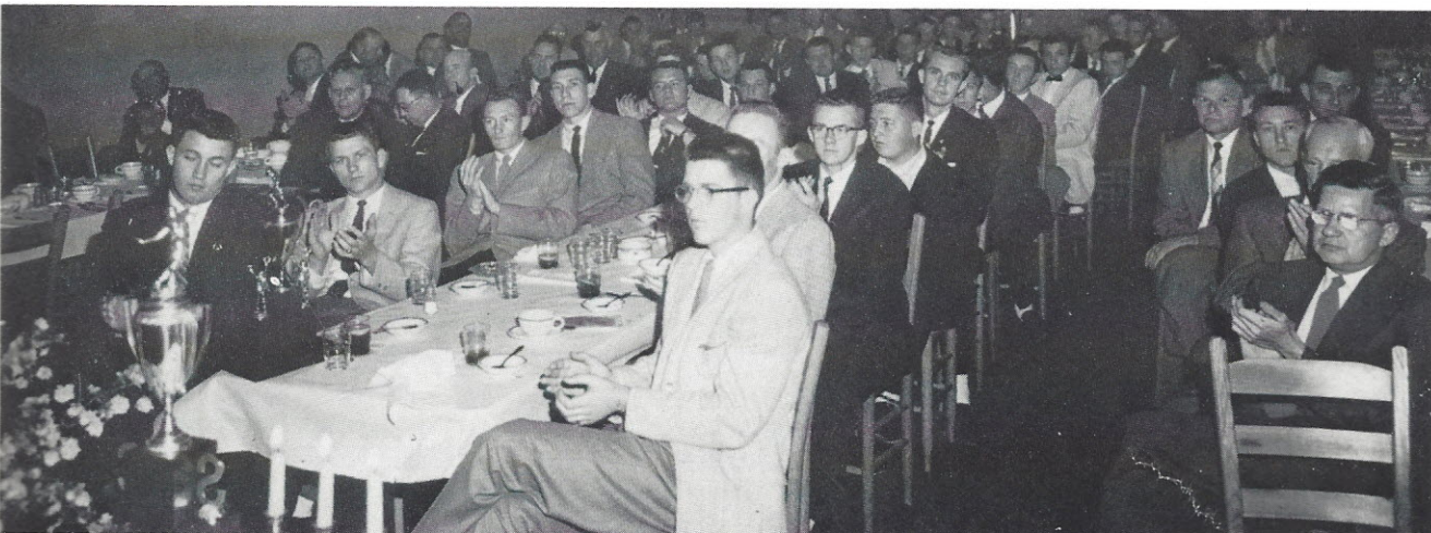
Champions and loyal supporters applaud guest speaker at Athletic Banquet.