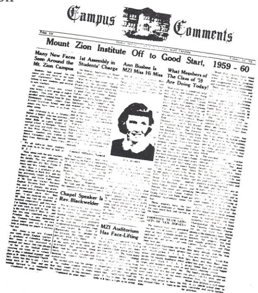
The School Paper