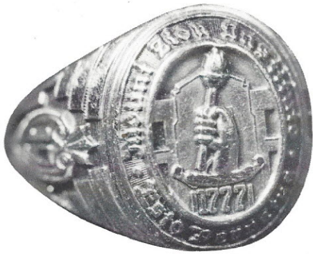
The 1960 Class Ring