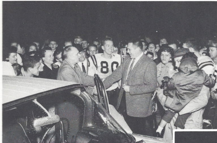
It's all yours coach!