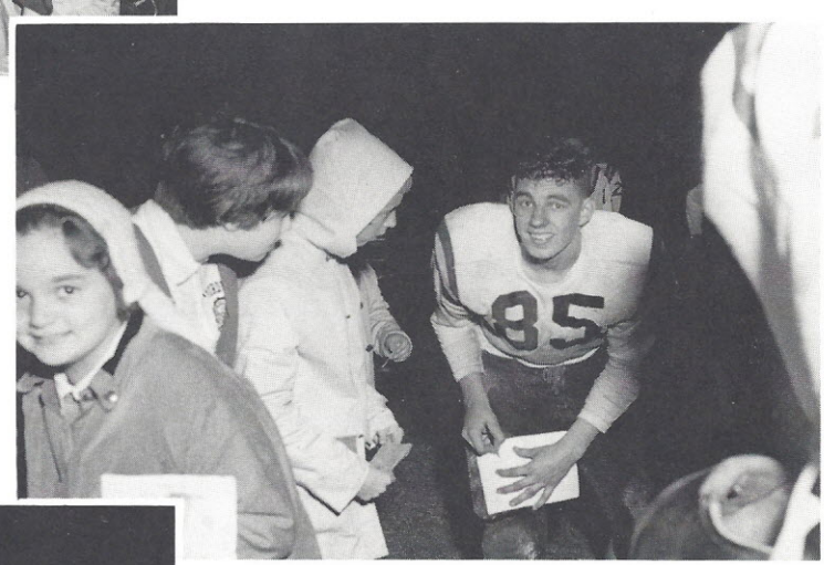
How does it feel to be state champs two years in a row, boys?