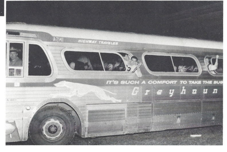
Page Seventy-Seven /