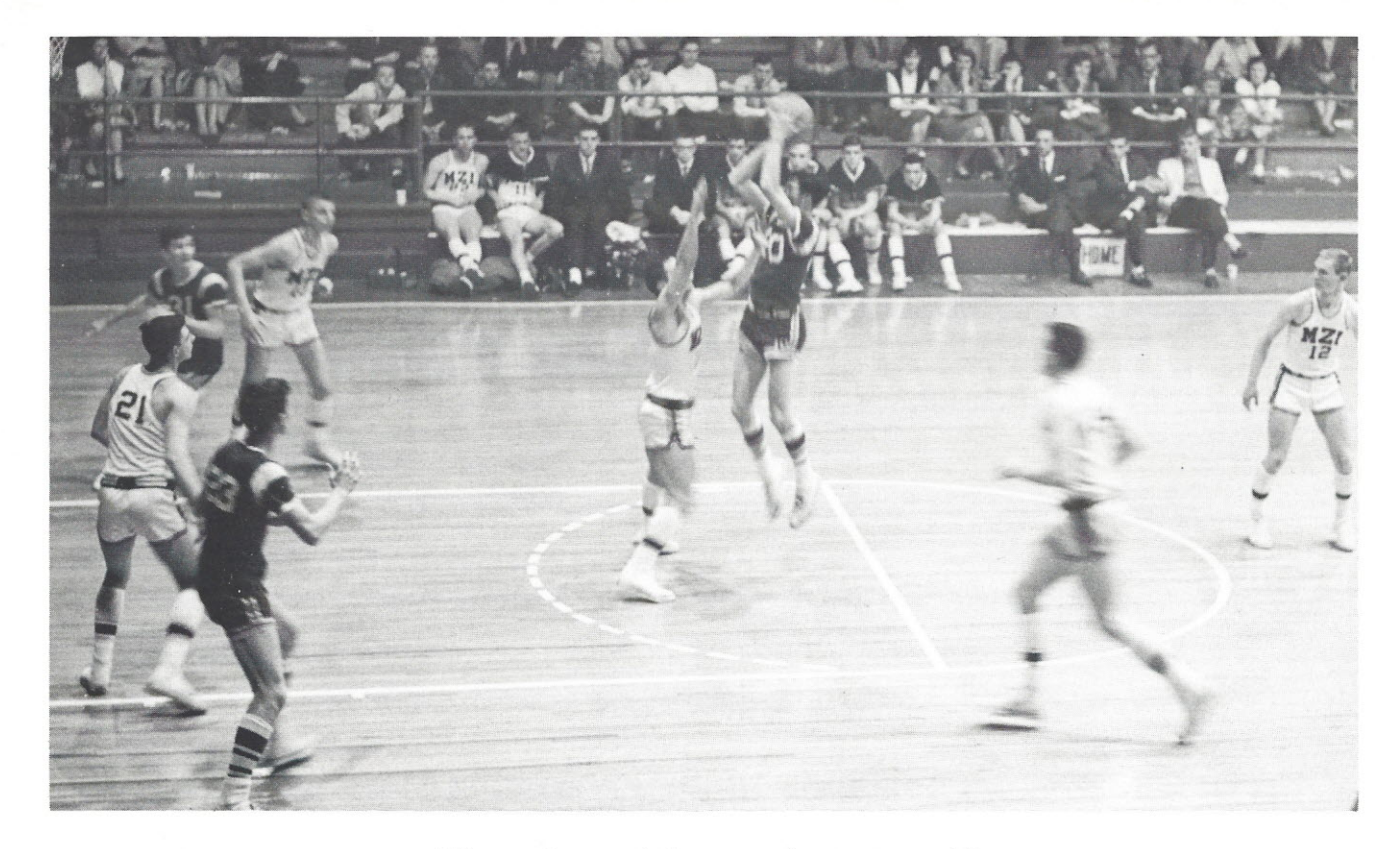
"An extra point can win a game!"