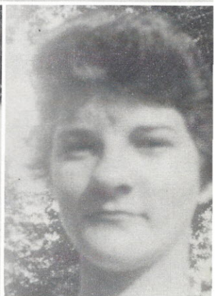
I'm not a WOLF!