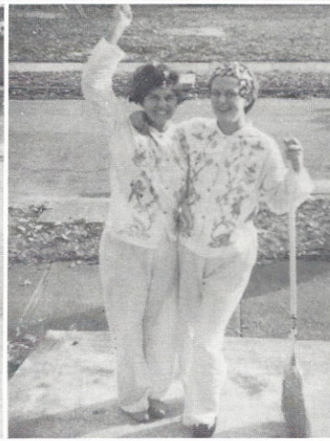
Made in Japan.