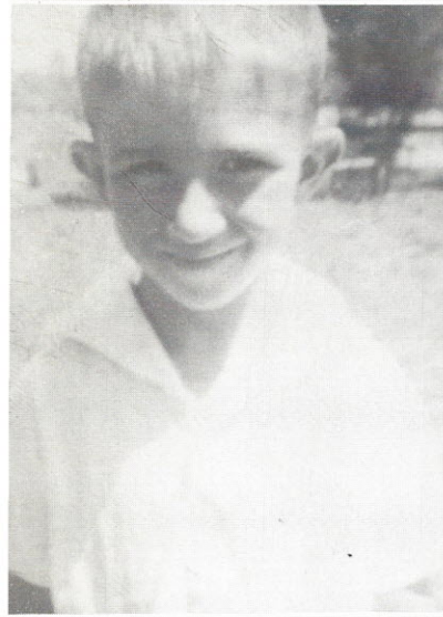
My name is Cookie. What's yours?