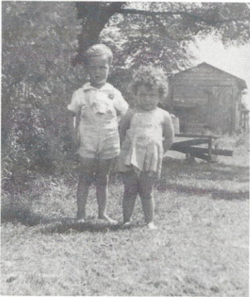
Crow and the Voice.