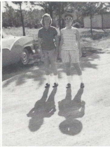
Is it possible for little people to cast big shadows?