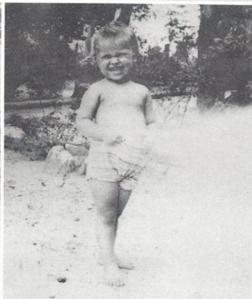
I've got ants in my pants.