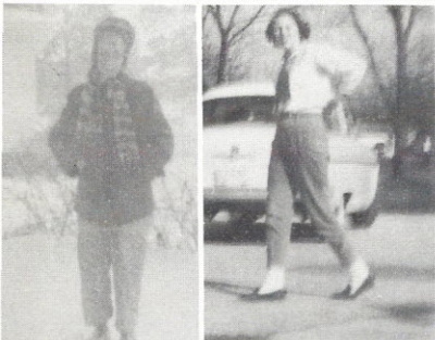
Parlez-vous français? Oh, my aching back.