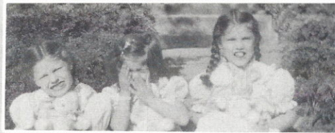
Three little Hiotts.