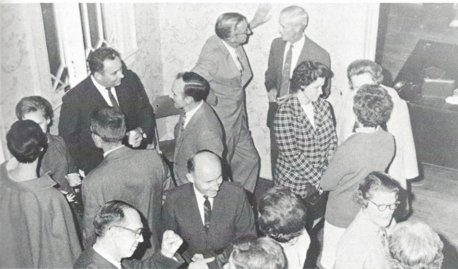
Parents, teachers, and friends enjoy good fellowship.