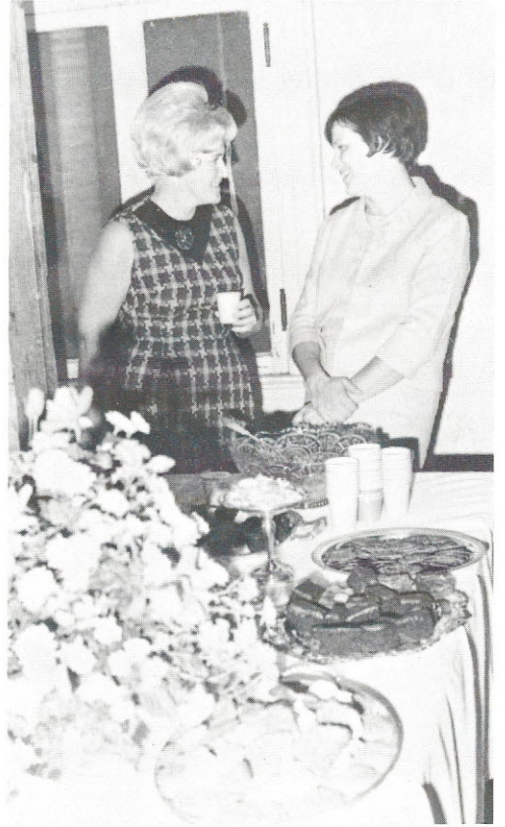
Beautiful and delicious refreshments.