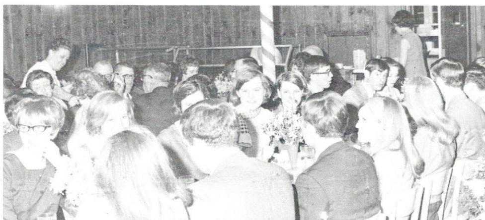
Players and guests enjoy delicious banquet.