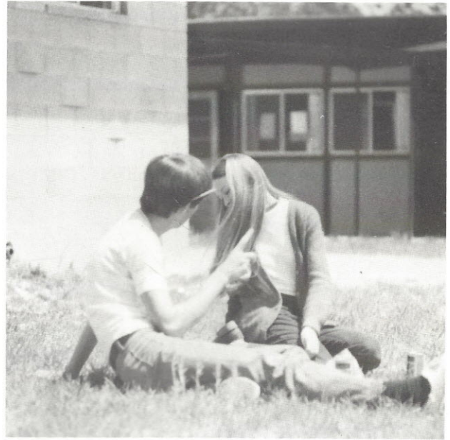
How sweet it is!