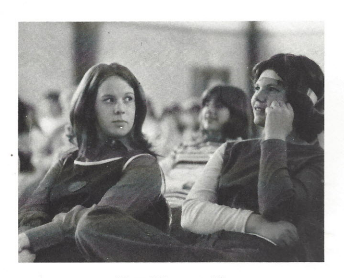
What did you say??