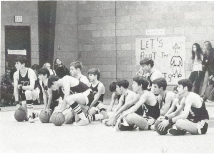
Boys, we know the gym floor is nice, but this is ridiculous!