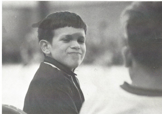
Ha, ha! Told you so!!