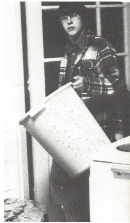
The trash man.