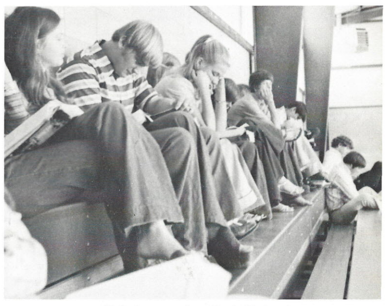
Wake me up when the bell rings!