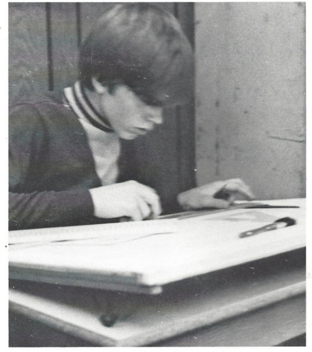
Back to the old drawing board.