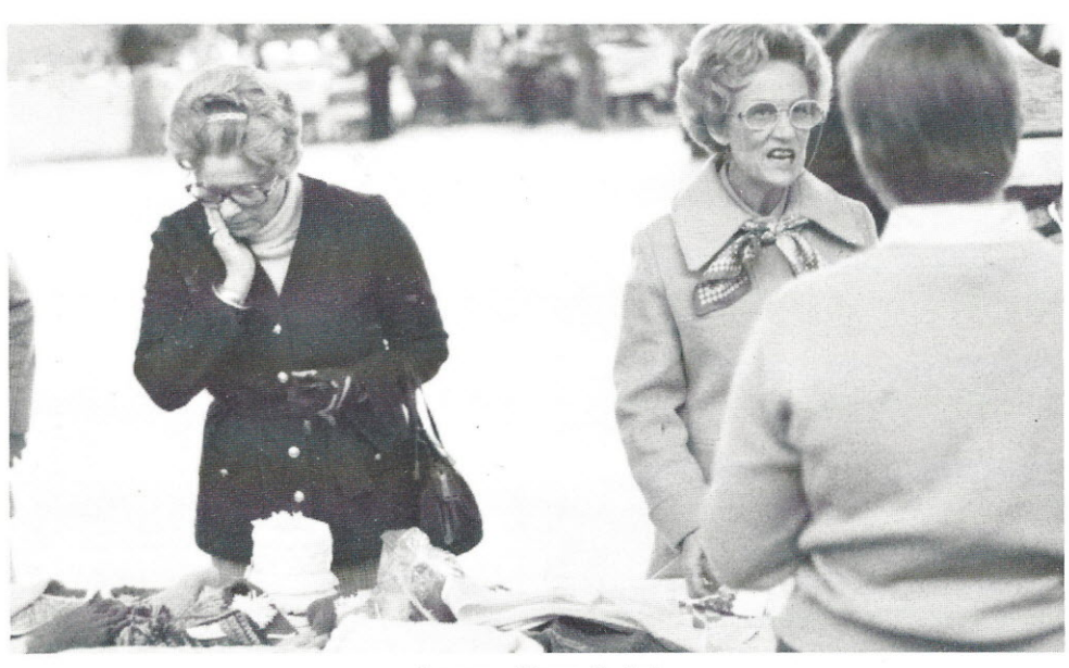
Shoppers at Harvest Festival