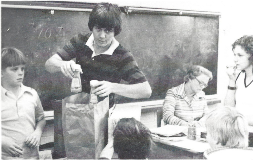
Packing up the spices