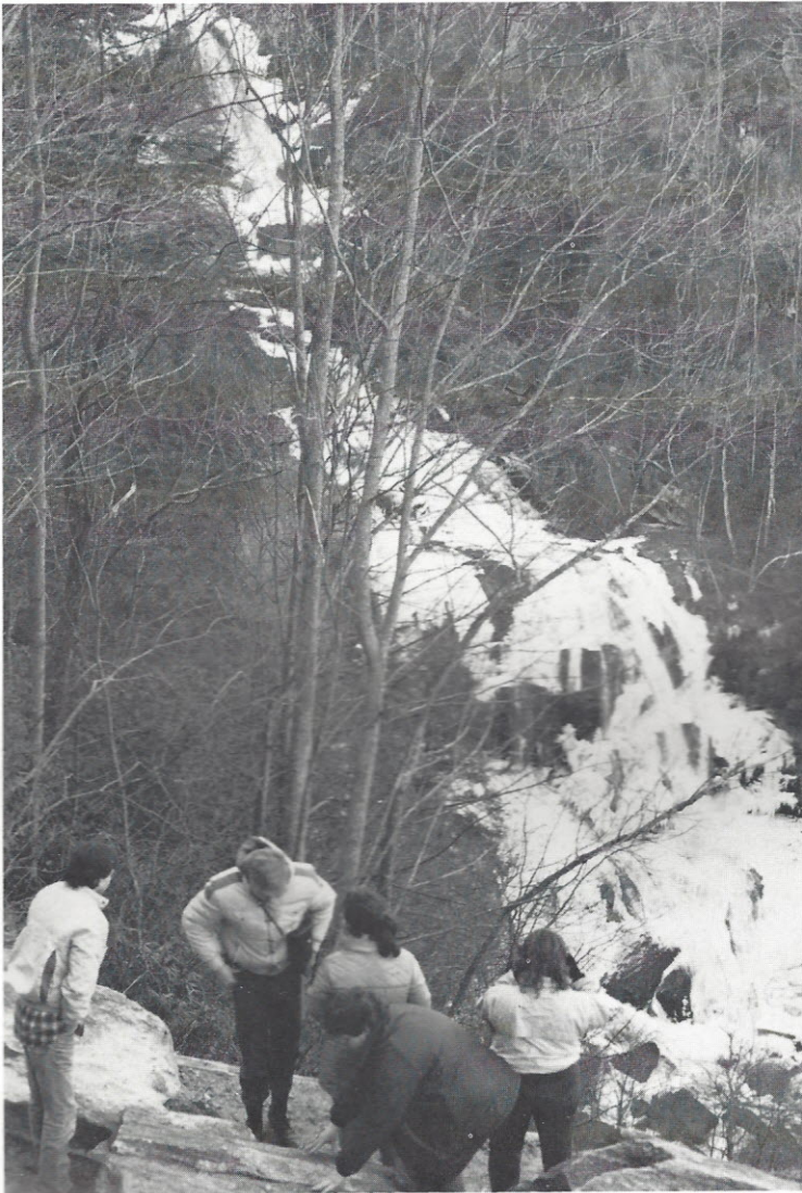
These seniors found Whitewater Falls especially picturesque during Mini-course week.