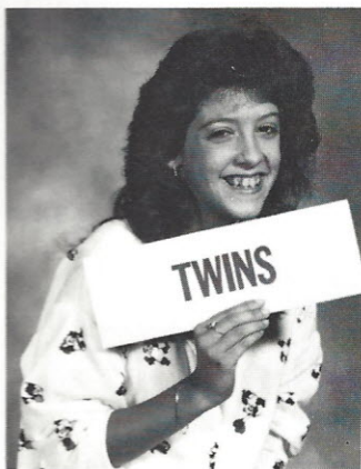
It's bad enough being twins without having to carry a label.