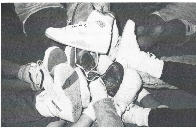
The sixth period P.E. class, made up of Ninth Graders, is all mixed up in their shoe styles. Nike, Reebok, and Converse tennis shoes and high-tops are just a few of the brands that are popular with them.