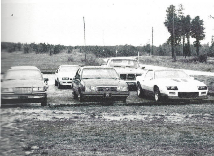
Someone's white camaro is parked in a space which is supposed to be used by a junior. The owner of this car is a sophomore. Oh no, this means war!