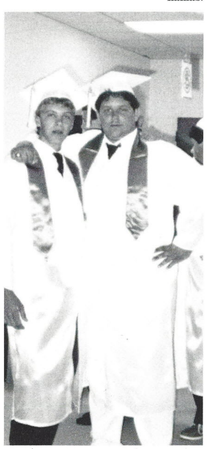
The Class of '88 is ready for the Bahamas.