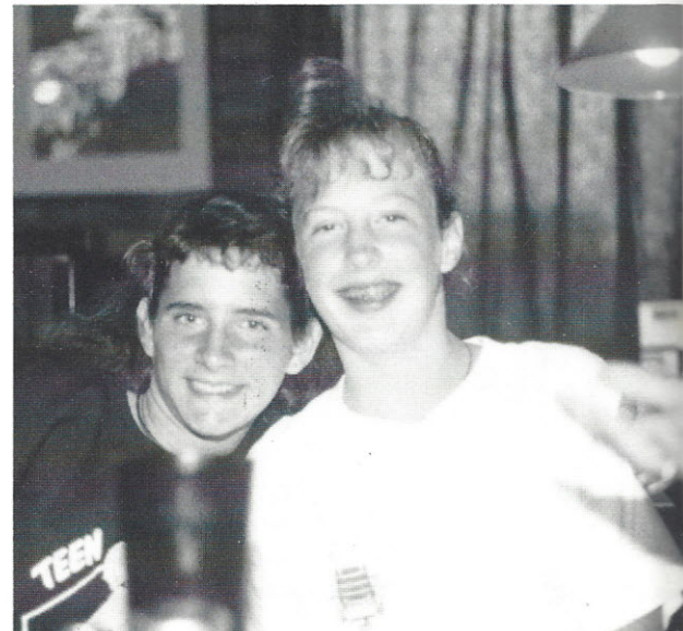
After the game, the two doubles partners enjoy themselves at Pizza Hut.