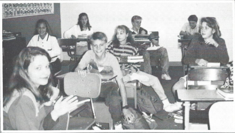
SUB-FRESHMEN HAVE WHAT IT TAKES — This group of eight graders exhibit many talents and personalities, but one attribute that outweighs them all is their achievement in academics as a class. They have repeatedly shown their skills on many occasions. Keep up the good work!