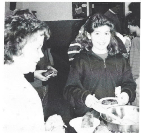
Everyone looks forward to lunch! Ch down!