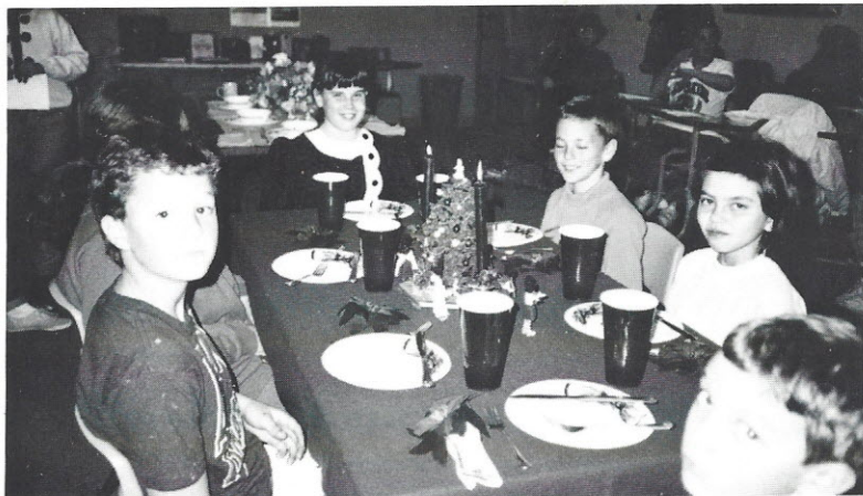
Learning manners is . . . FUN!