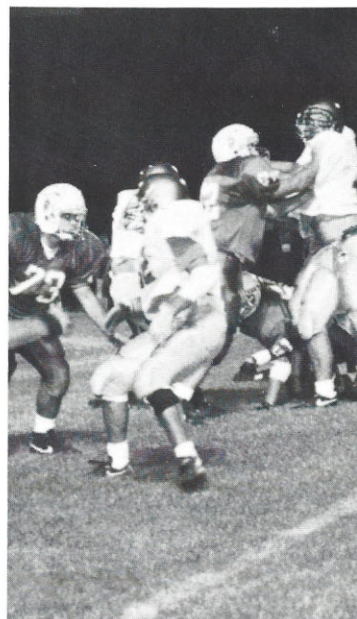
Every Richard Winn varsity football game is not without action during a play.