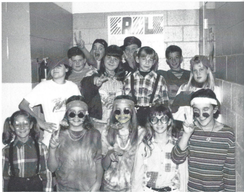
A GROUP EFFORT. These sixth graders really get into the school spirit by participating in the Hippie/Neer Day. The majority of their class dressed up for each special day to show their spirit.