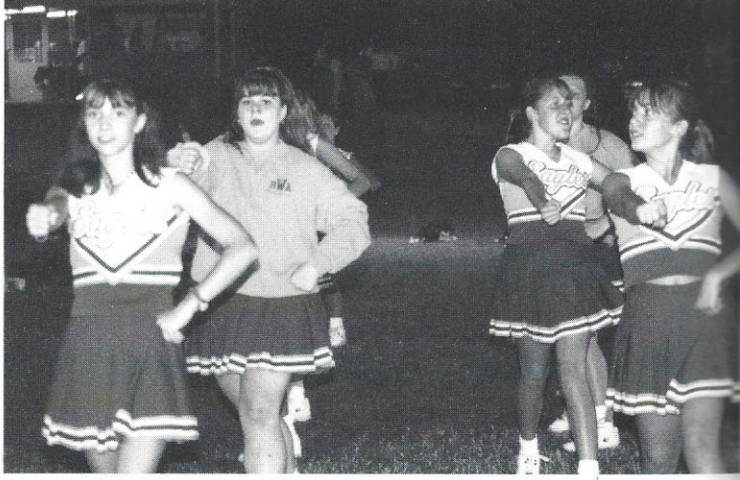
WE WANT SIX! The cheerleaders do a cheer to encourage the football players to strive for a touchdown. The cheerleaders like the players, did an excellent job this season.