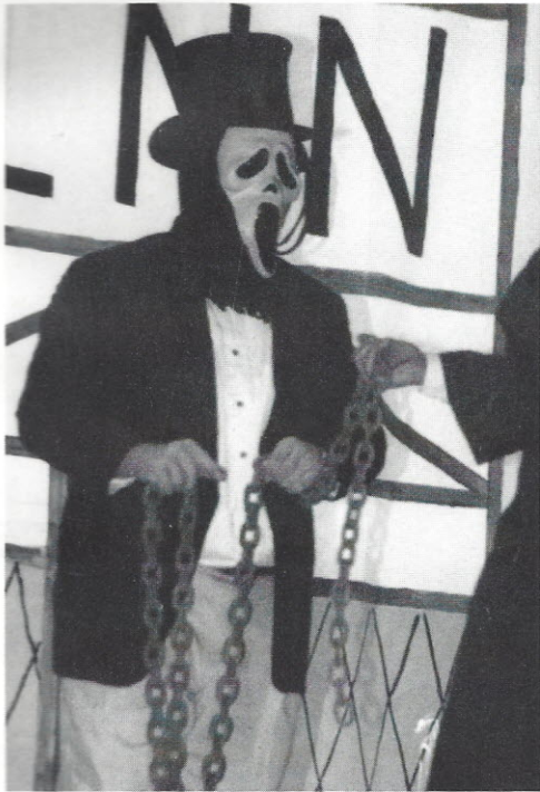
CLANK! CLANK! CLANK! The ghost of Christmas future that the audience will all anticipate year after year.