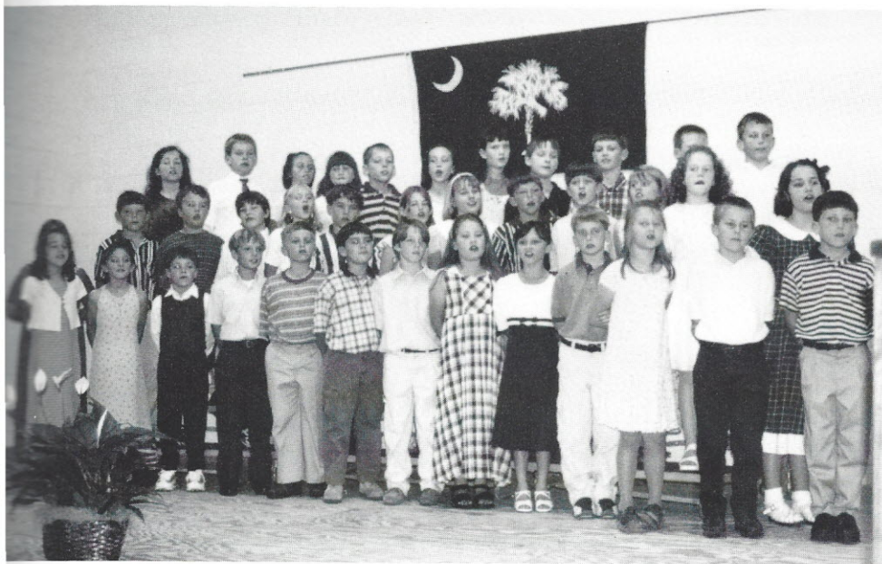
SMILING FACES, BEAUTIFUL PLACES. After learning a great deal about our beautiful and historic state, the third graders performed a music program about SC. Not only did they study and sing about our great state, but they also created SC scrapbooks.