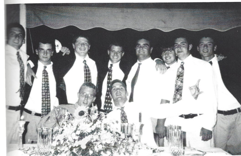
IT'S PARTY TIME! It's clear to see that these senior boys know how to enjoy a moment of celebration at the Graduation Dinner party. Not only did these guys work together to win state championships in golf and football, but they also bonded to create lasting friendships.