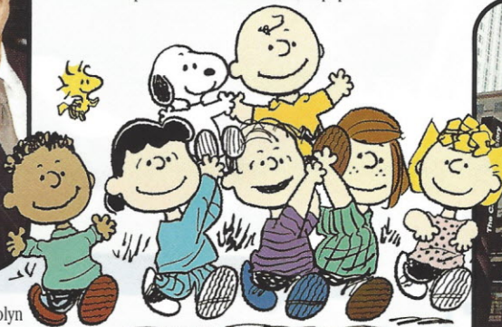
PEANUTS