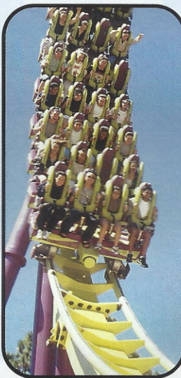
Six Flags Great Adventure

The long-awaited prequel Star Wars: Episode I The Phantom Menace hits theaters in May 1999, taking in a record-breaking $28.5 million on its opening day and going on to gross more than $420 million.