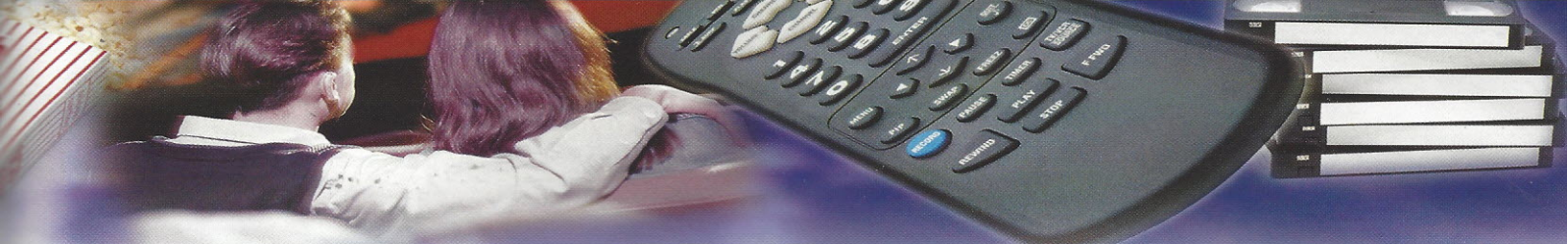
Konami Corporation of America, Inc.