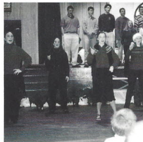
Jingle Bell Rock: The junior girls were in charge of putting the dance together for the Christmas play. The girls were really creative and made the play fun for everyone.