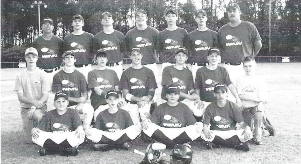
• 2003 JUNIOR VARSITY BASEBALL •